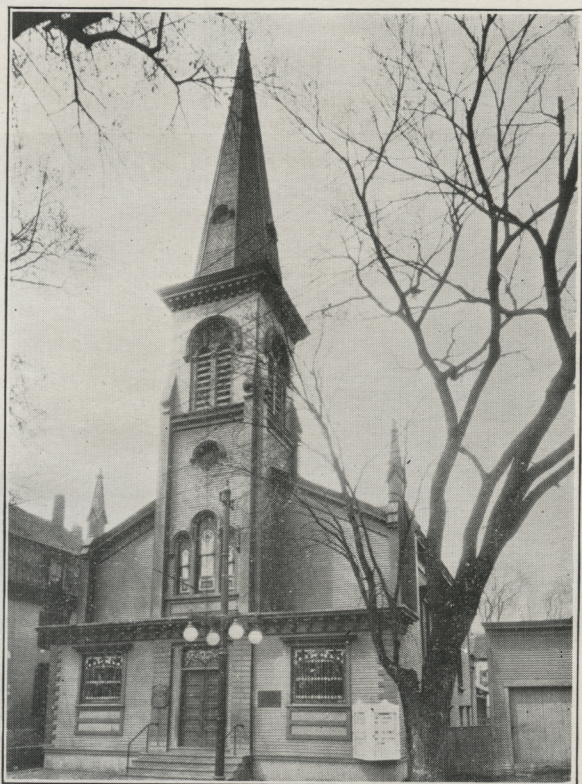
JEFFERSON STREET BAPTIST CHURCH